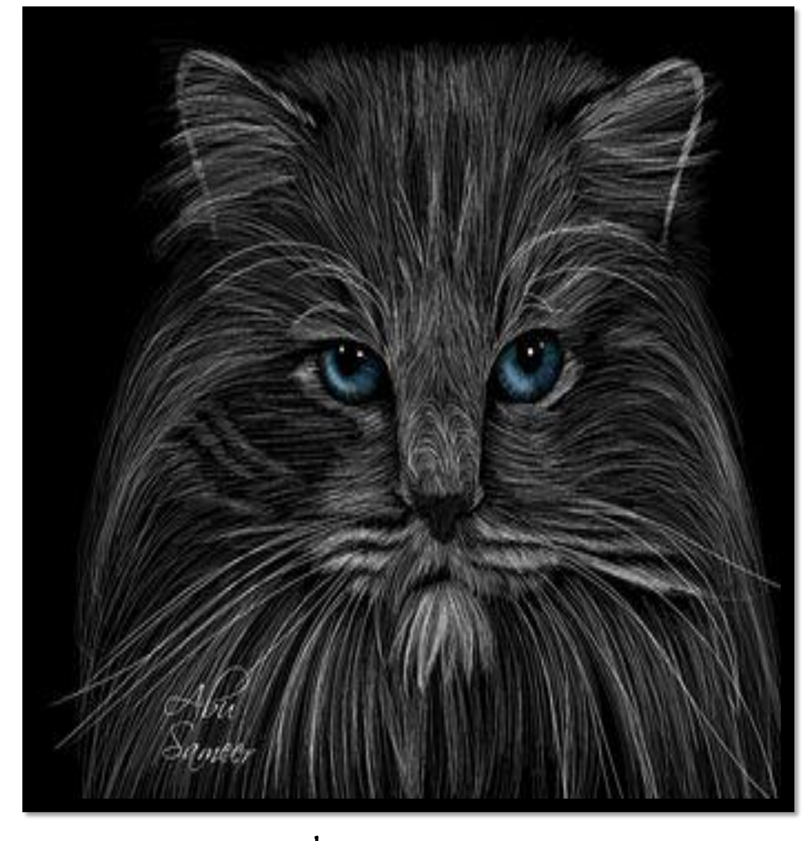
The Parson Cat (This drawing is realized by: Ab Sameer Hammad )